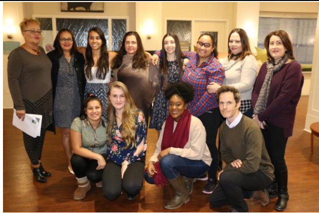
MVYLI 7th Job Shadow Day 2017