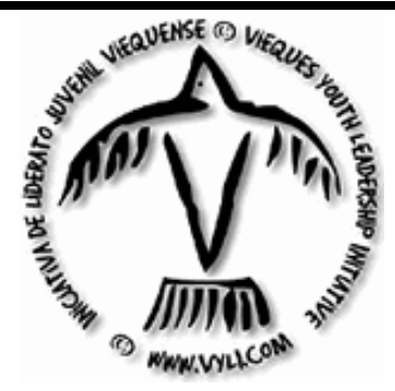
Vieques Youth Leadership Initiative